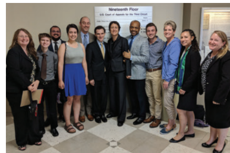
Our legal team and clients pause outside the Third Circuit Court of Appeals in May.

The ACLU of Pennsylvania, national ACLU's LGBT and HIV Project, and cooperating counsel from Cozen O'Connor intervened in the case on behalf of the Pennsylvania Youth Congress (PYC), an LGBQ&T youth advocacy group that has members at Boyertown Area Senior High School who would be harmed if the plaintiffs