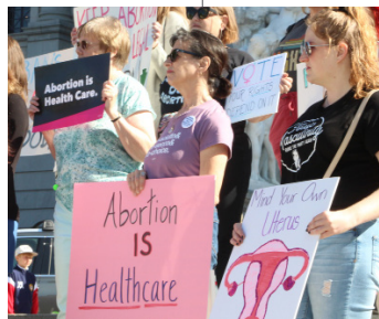
ACLU-PA joined lawmakers, partners, and concerned Pennsylvanians at the capitol in September to protest an anti-abortion constitutional amendment (see page 3)

The moment we had all been anticipating with dread came on June 24, when the U.S. Supreme Court overturned Roe v. Wade . The court wiped away 49 years of its own precedent. The fallout of that decision is serious and is impacting Pennsylvania.